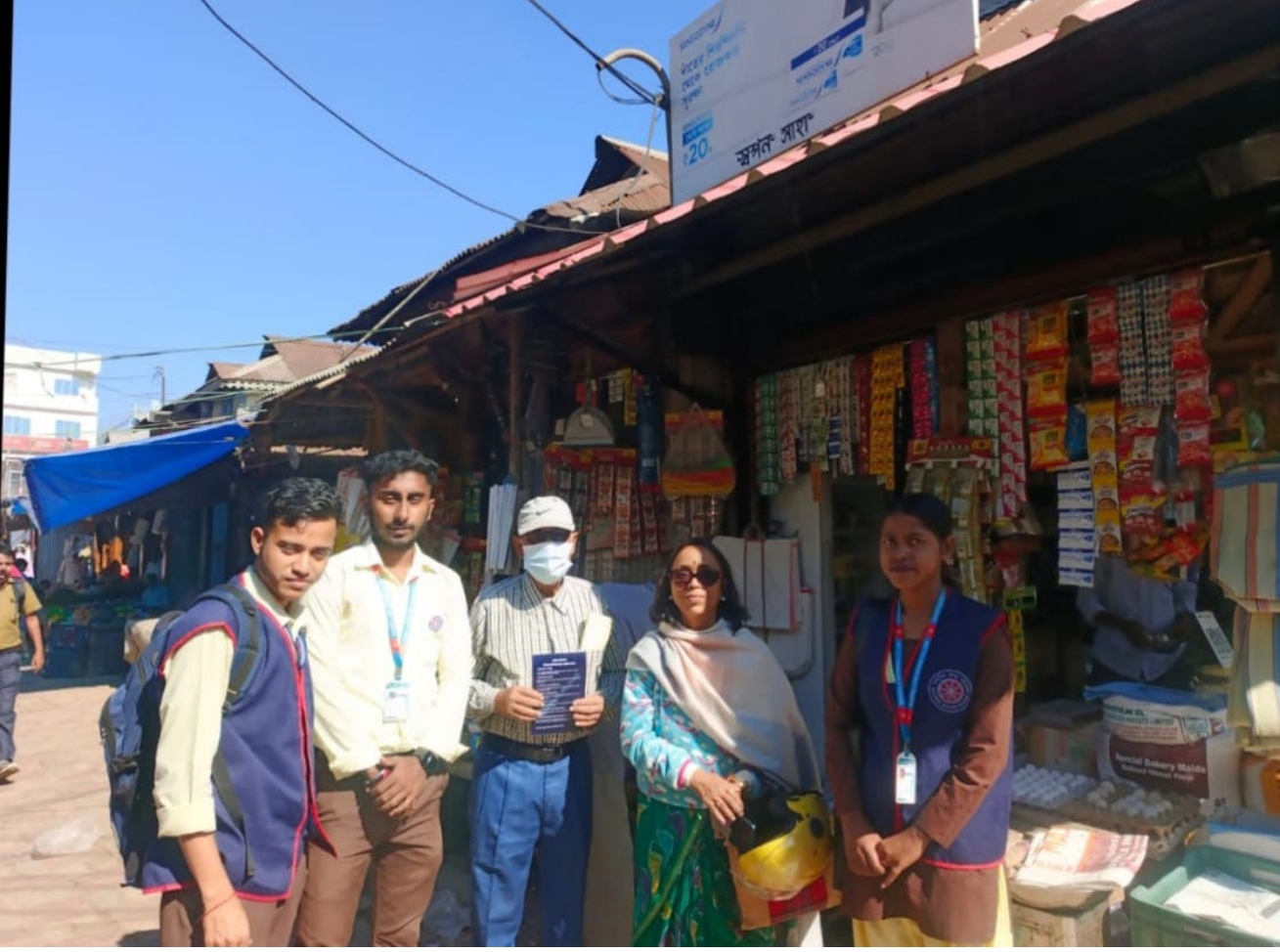
Near, Dhaleswar Rd Number 16, Shibnagar, Dhaleswar, Agartala, Tripura 26 Nov 2025 10:09 AM 26 Nov 2025 10:09 AM